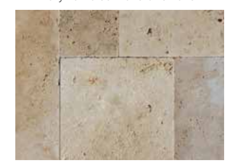
Ivory Tumbled Travertine Paver