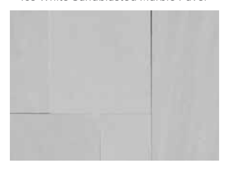
Ice White Sandblasted Marble Paver