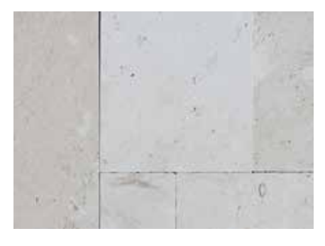
Shellstone Beige Tumbled Limestone Paver