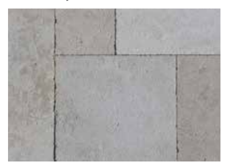
Diana Royal Leathered Marble Paver