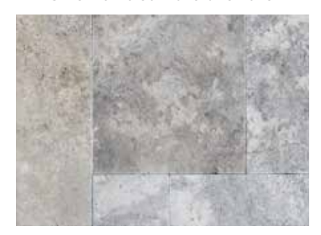
Silver Tumbled Travertine Paver