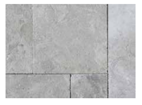
Tundra Gray Leathered Marble Paver